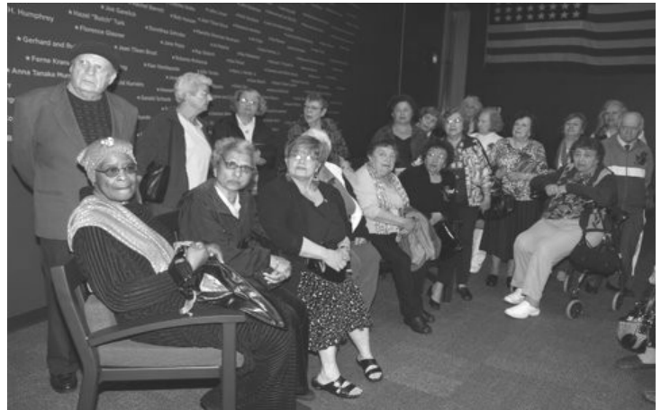
VOICE Participants at "abUSed: The Postville Raid" Screening, June 2010