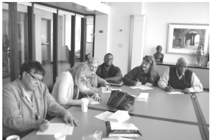
JCA and NCRC Members at Temple Israel, February 2010