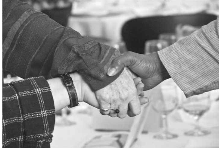
JCA Seder at Mount Zion Congregation, March 2010